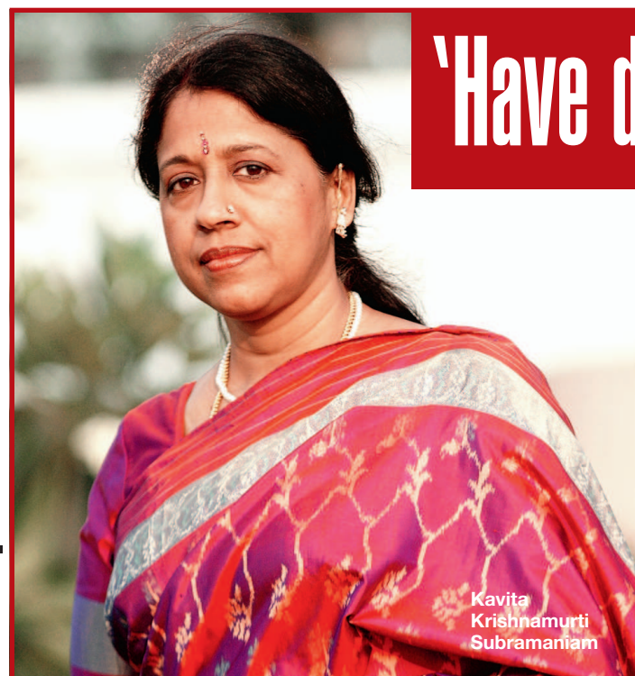
Kavita Krishnamurti Subramaniam

Singer Kavita Krishnamurti Subramaniam on what keeps her busy these days and more in a chat with AT