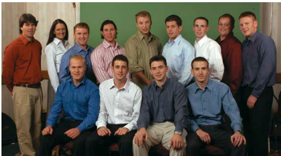
2005 GSEA REGIONAL AWARD WINNERS COMPETE AT THE CEO CONFERENCE IN ORLANDO, FLORIDA, USA.

Since 1998, the GSEA program, a program run out of the John Cook School of Business at Saint Louis University, has honored outstanding undergraduates. The program's mission is to inspire students to adopt entrepreneurial endeavors by bringing global visibility to undergraduate business owners whose companies adhere to high ethical standards and are innovative, profitable and socially responsible.